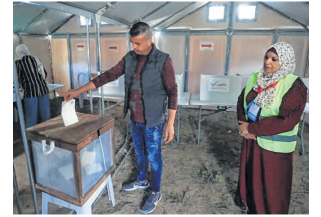
A Palestinian casts his ballot at a polling station during local elections in Deir el-Balah, Gaza Strip, on Saturday

Hamas for the Gaza vote and has been unable to send ballot materials into the enclave. COGAT, the Israeli military body overseeing humanitarian affairs, did not respond to queries regarding election materials. Average turnout in past local elections has been 50% to